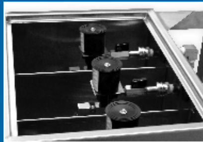
Storage tank features a recessed lid, keeping the unit clean.